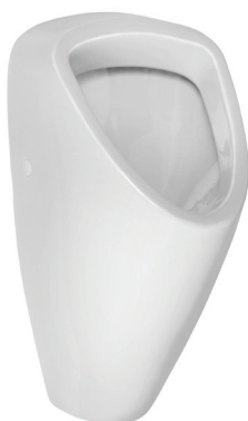
SLP 49 - CAPRINO PLUS